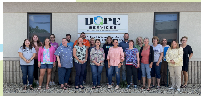
HOPE Services Earns 3 Year Accreditation

Adults Supported are Employed in the Community